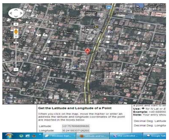
Figure 4.2 Target Location

With the proposed system, the concept is that the information of the mobile owner is tracked and stored in a online database for the authorized person to view the information later. He can view the geographical location of the mobile owner by entering the latitude and longitude information in the itouchmaps.com. The application automatically sends data to the server whenever there is a new record of tracked information.